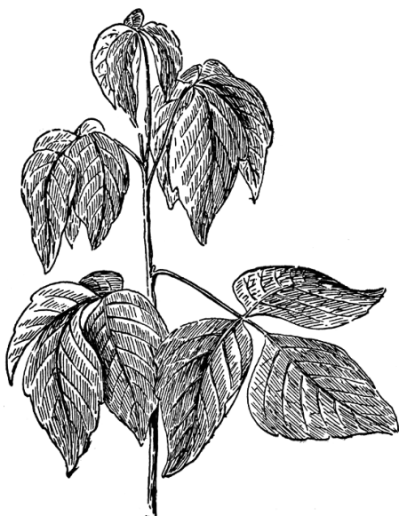
Clipart ETC is copyright © 2010 by the University of South Florida.

Additional information may be seen at our web site: http://www.tennesseetrails.org/blog/clarksville